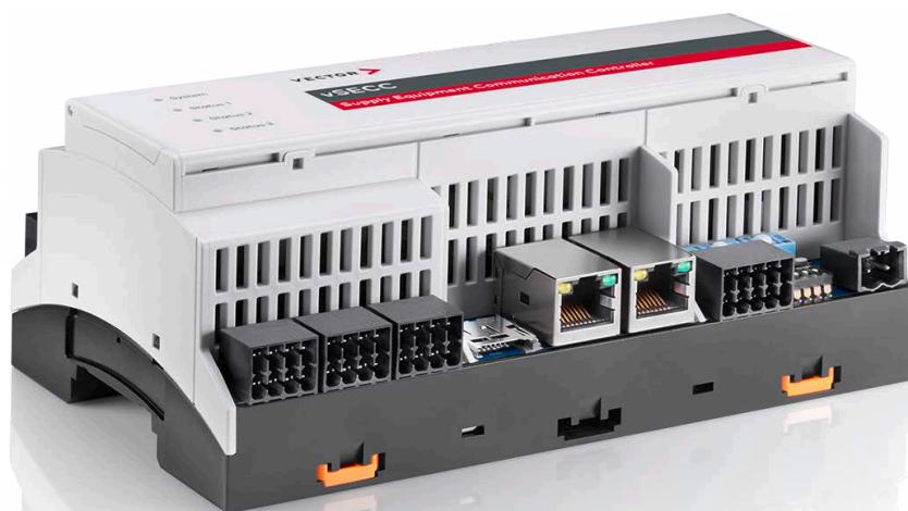
vSECC: Ready-to-use Communication Controller