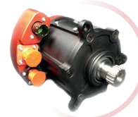
Eshift 3R ACTUATOR