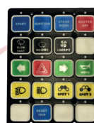
SP-20 SWITCH PANEL