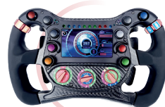
Formula STEERING WHEEL