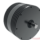
LVMX-30 ELECTRICAL MOTOR